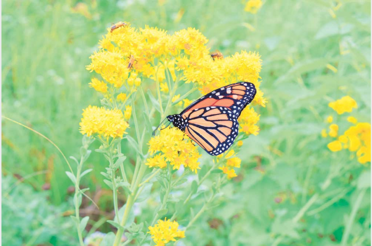
Figure 2. Monarch butterfly.

The North American monarch butterfly population has plunged from 1 billion to less than 60 million over the past 20 years, possibly from loss of critical habitat (figure 2). The Monarch Conservation Science Partnership convened four times over 24 months at the Powell Center to develop robust estimates of extinction risk, regional conservation priorities, priority threats, and specific restoration scenarios. Their report informed the development of a national strategy to promote the health of honeybees and other pollinators (Pollinator Health Task Force 2015). Plans for conservation have been expanded to include habitat in Canada and Mexico through the Trilateral Committee for Wildlife and Ecosystem Conservation and Management.