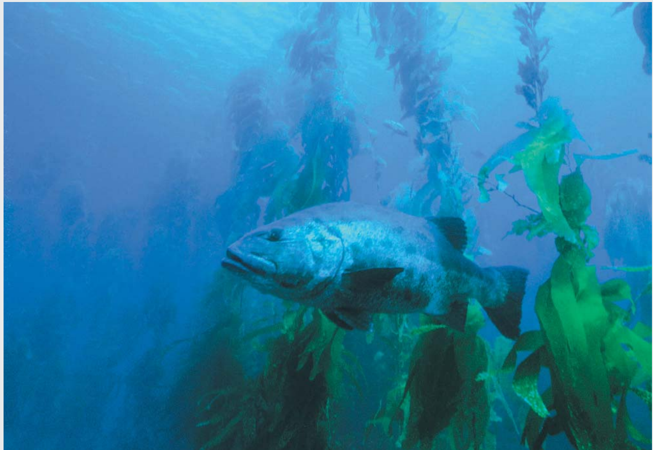
Figure 1. The Channel Islands National Marine Sanctuary was established, in part, because of evidence amassed on the value of marine protected areas as a result of a synthesis-center working group.

Another particularly influential NCEAS working group concerned with theory to support the design and establishment of marine reserves convened in the 1990s (figure 1; Allison et al. 2003). The group amassed evidence of the positive influence of no-take reserves on fish stock diversity, biomass, body size, and fecundity and their associated spillover effects. This evidence contributed to the establishment of a marine protected area network in California's Channel Islands and ultimately to the development of the California Marine Life Protection Act of 1999 ( www.dfg.ca.gov/marine/mpa/intro.asp ).